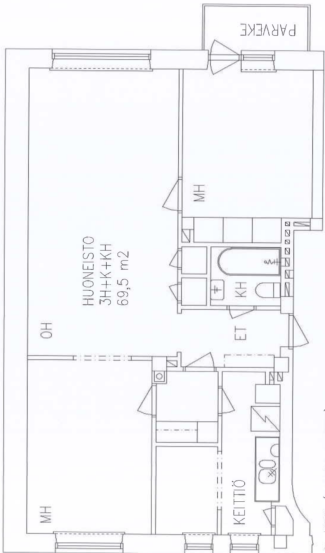
2. KRS (MATALA OSA)